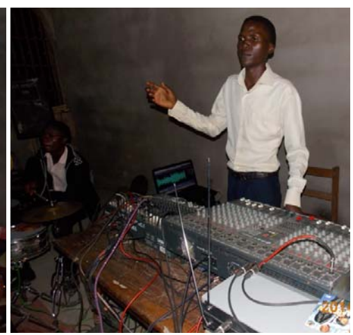
Thursday, May08, 2014 - Saturday, May 10, 2014

These days were consecrated for follow-up. The program of the follow-up sessions included a brief introductory message, a short Bible study and sharing in groups, film projection, and at the end, prayers.