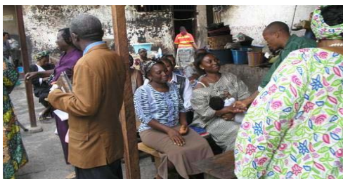
Top to Bottom: Follow-up meeting with crusade converts; Gifts for inmates – rice, cooking oil, etc.; Ministry in one of the prison wards; Bibles and more supplies; Decisions for Christ; In the Women's Ward.