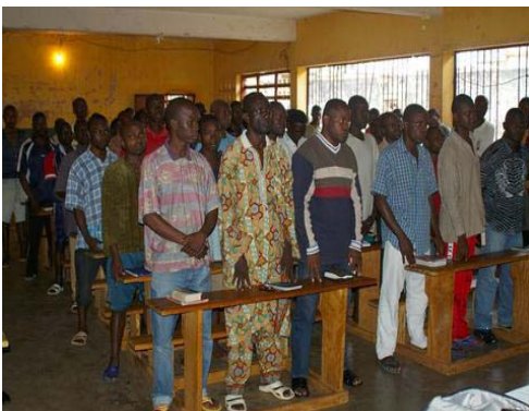
Top to Bottom: The greatest in the Kingdom; Our Strategy was soaked in prayer; A few of the hundreds at the conference; Entrance to the Yaoundé Central Prison; Inmates at the Prison Conference; Some of the classics we took to Cameroon; Wondering who the African is in the Team?